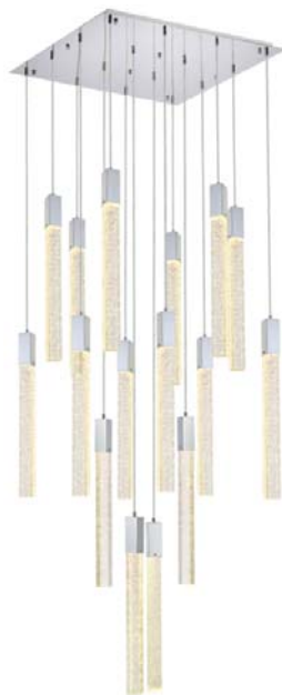
Chrome Item No: 2066G30C