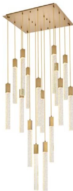
Stain Gold Item No: 2066G30SG